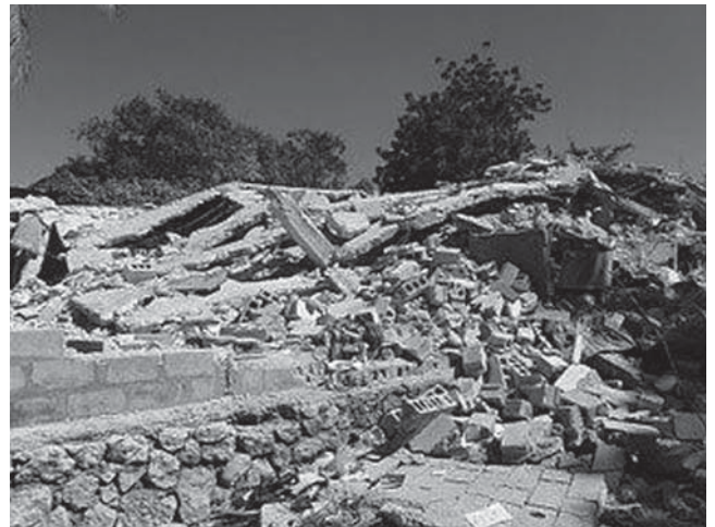
The remains of the CONASPEH building.